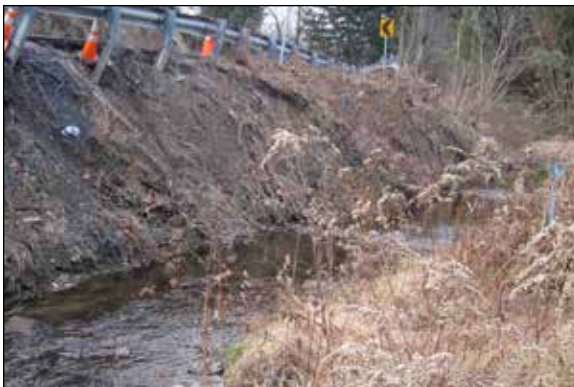
Eroded roadway project site, before