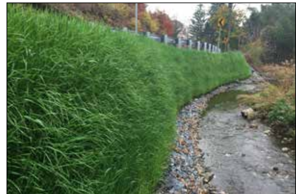
GreenLoxx MSE Vegetated Retaining Wall, after

Copyright 2005-2021, Filtrexx International, all rights reserved. Unauthorized reproduction prohibited. All statements, product characteristics, and performance data contained herein are believed to be reliable based on observation and testing, but no representations, guarantees, or warranties of any kind are made as to accuracy, suitability for particular applications, or the results to be obtained. Nothing contained herein is to be considered to be permission or a recommendation to use any proprietary process or technology without permission of the owner. No warranty of any kind, expressed or implied, is made or intended.