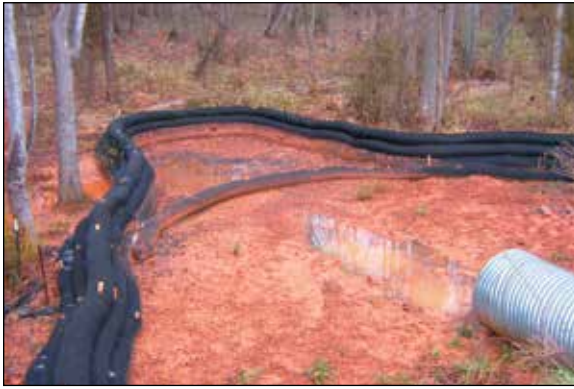
Use at Basin Outfall.