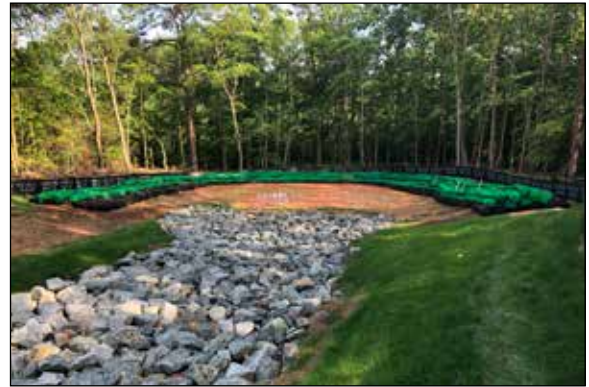
Use at the base of a channel or swale prior to final discharge