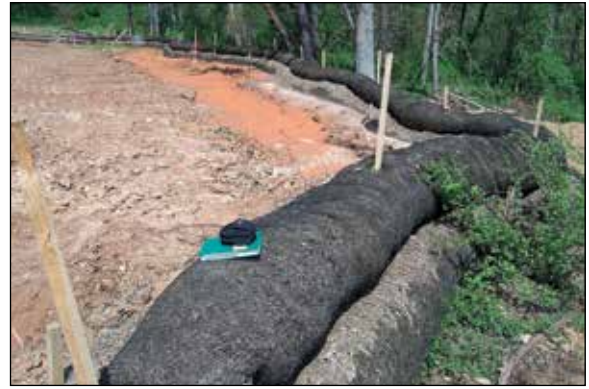
Large Sediment Storage Capacity.