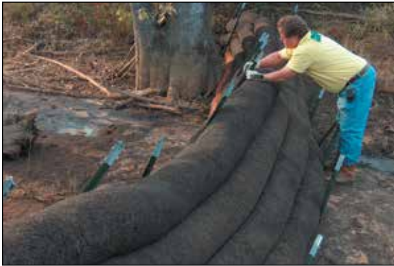
Stacking Method for Sediment Traps.