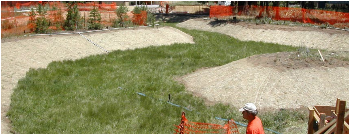
Biofiltration swale