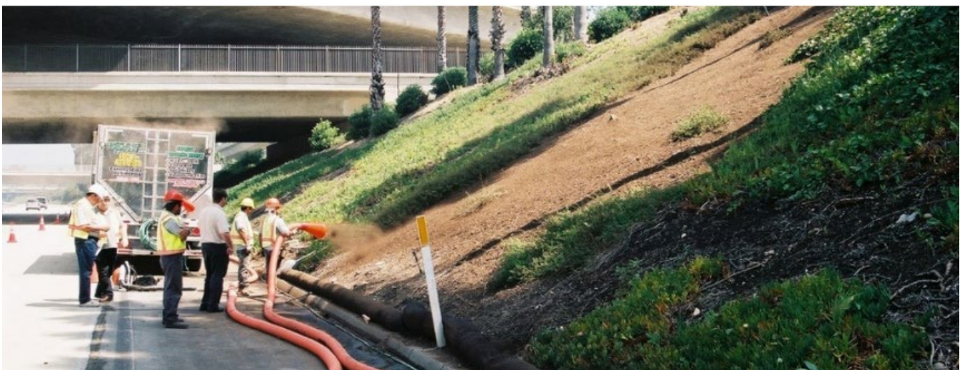
Roadside application of compost blanket