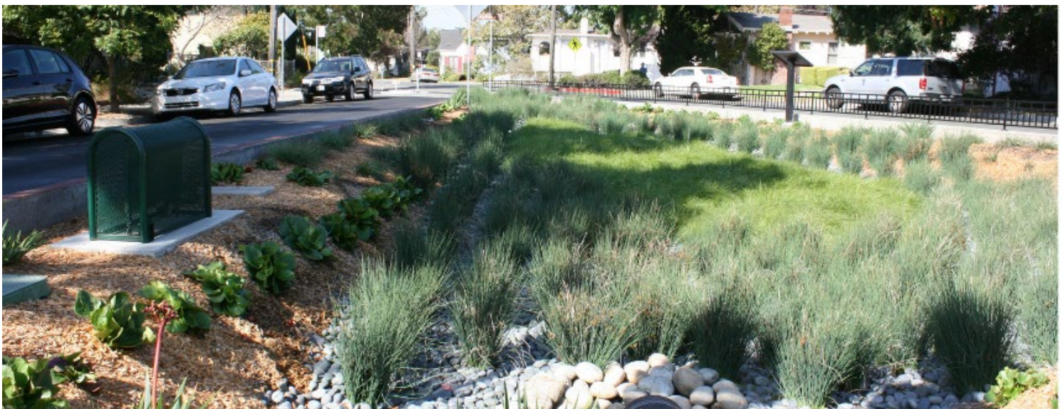
Rain garden retrofit replaced excess asphalt as part of green infrastructure project in Berkeley

Mike is a Senior Landscape Architect with Caltrans' Office of Roadside Management, responsible for coordinating the production of roadside policy, procedures, and standards. Mike coordinates with designers and Contractors the development of erosion control and compost contract specifications for the reduction of storm water run-off and sedimentation, maintenance of water quality, and improvement of soil and plant health.