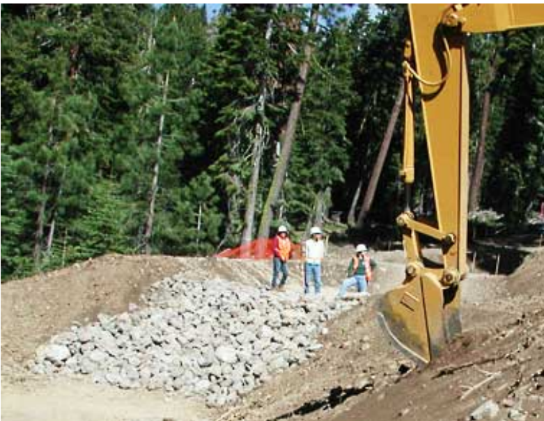
Compost Incorporation, Placer County, Route 267, photo courtesy of Caltrans

The workshop is for Caltrans district designers, including landscape architects, biologists, and stormwater quality coordinators; Caltrans contractors, and others involved in improving stormwater quality. The workshop will provide practical tools and information on improving roadside revegetation and stormwater quality with compost based BMPs.