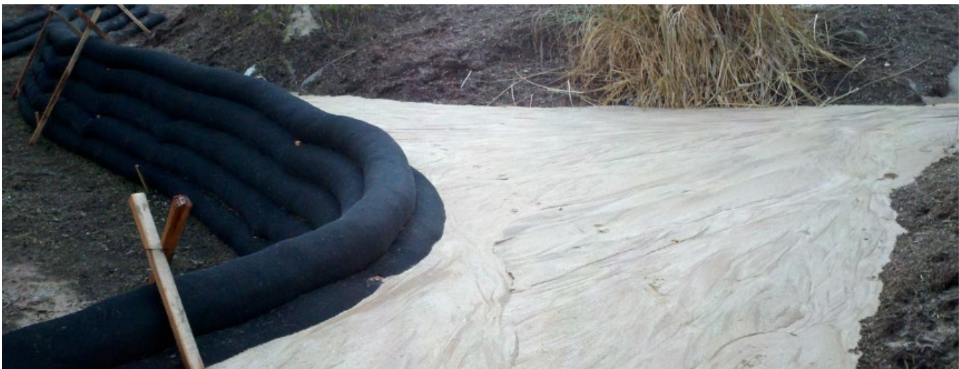
Sediment trap, 12-inch diameter filter socks in pyramid stack