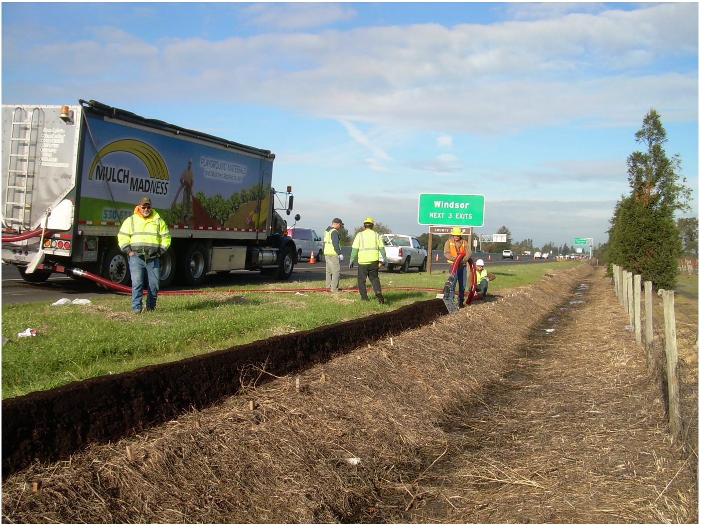
Compost Berm replaces multi-failed silt fence, Highway 101, Windsor, CA, photo courtesy of Salix Applied Earthcare

Directions on registering for the webinar are available on page 8 of this brochure.