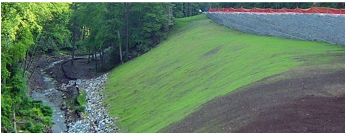
Seeded compost erosion control blanket