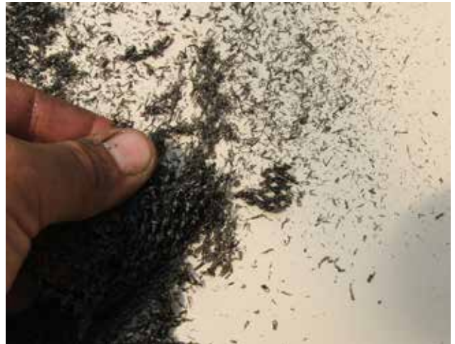
Filtrexx oxo-biodegradable HDPE

For applications where Filtrexx® Soxx™ are permanently vegetated, the canopy shields the Soxx from destructive UV exposure, which will also make the Soxx invisible. This permanent UV protection ensures long term structural integrity to Soxx and is an important design consideration for any long term, vegetative application.